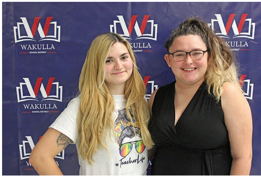
Crawfordville Elementary School's new teachers.