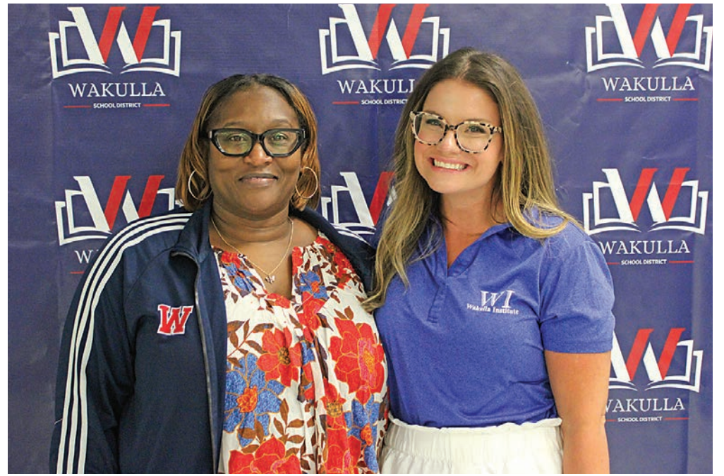
Wakulla Institute's new teachers.