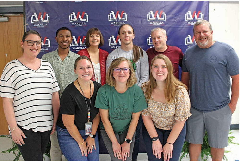
Riversprings Middle School's new teachers.