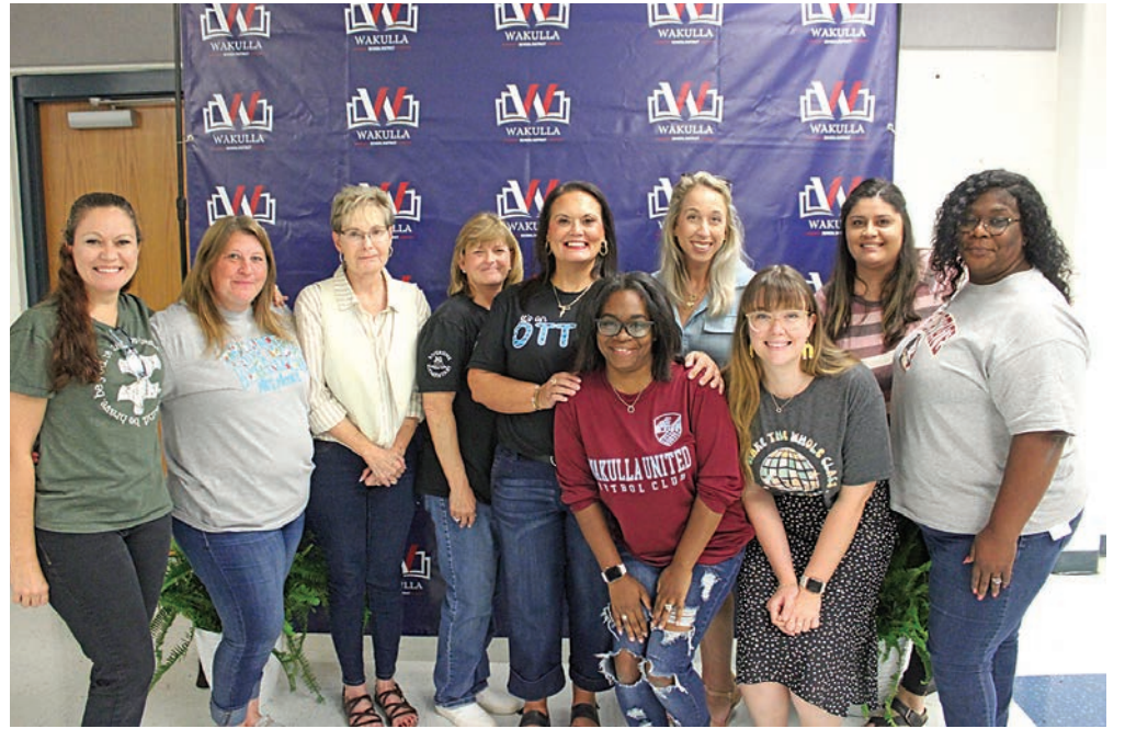
Riversink Elementary School's administration and new teachers.