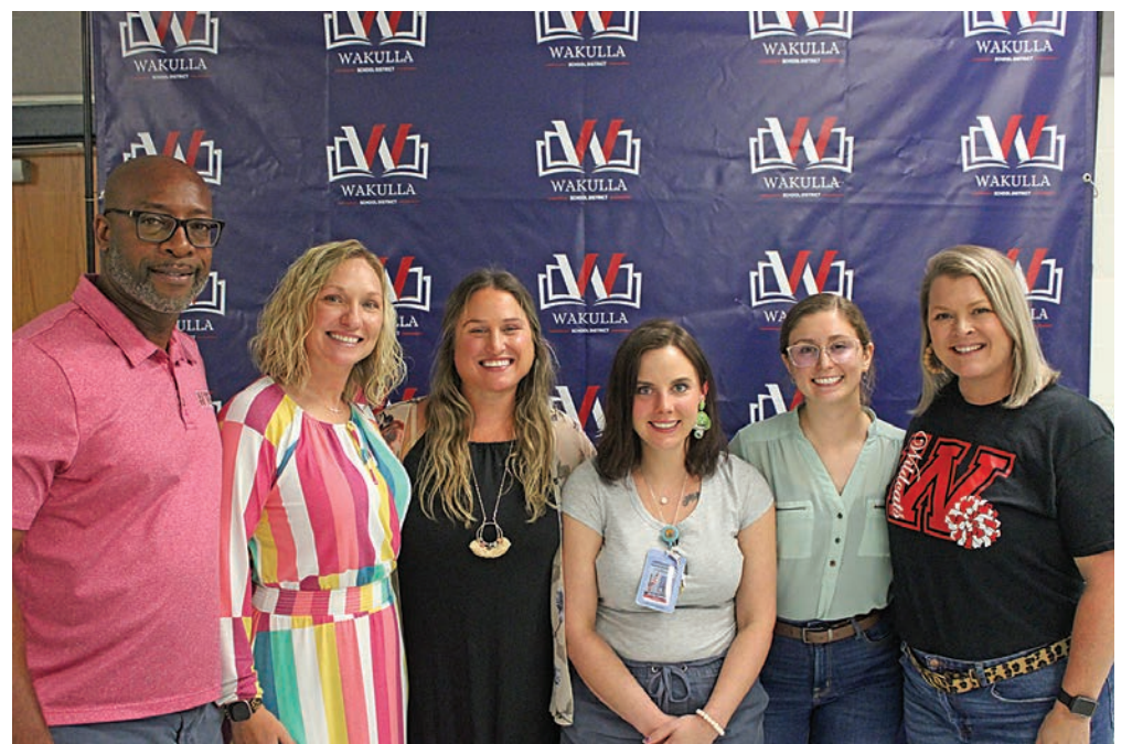
Wakulla Middle School's new teachers.