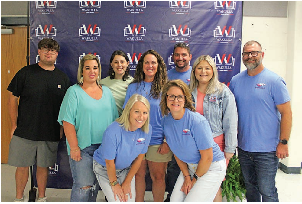
Wakulla High School's administrators and new teachers.