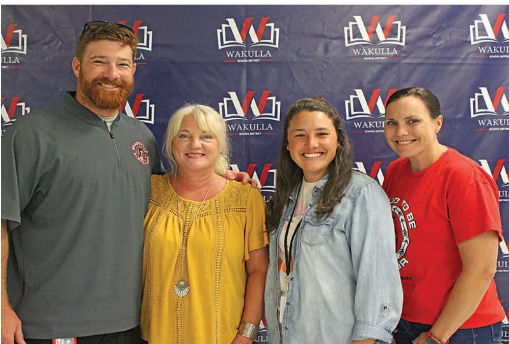
Shadeville Elementary School's new teachers.