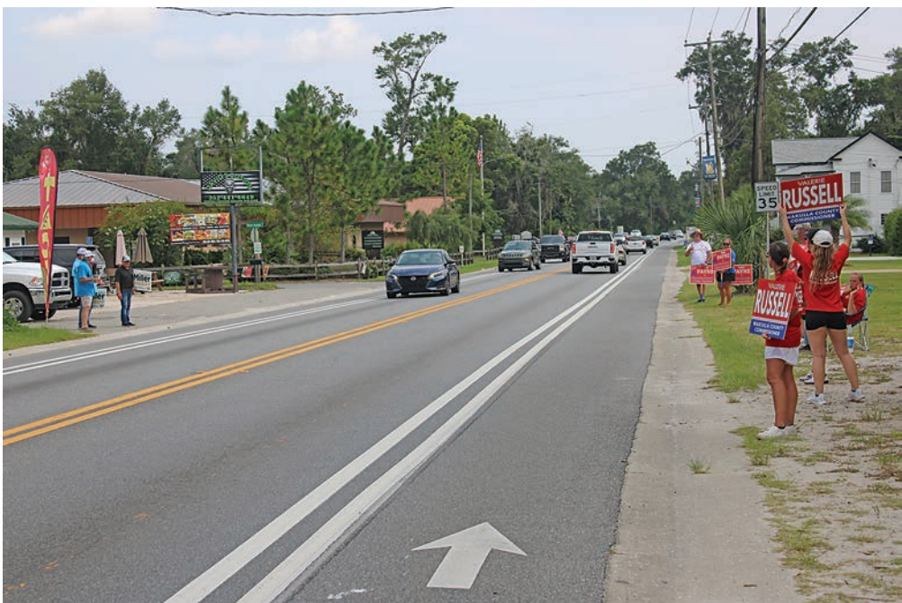
Some of the candidates waving at cars near the supervisor of elections office on Saturday, Aug. 10 – the first day of early voting