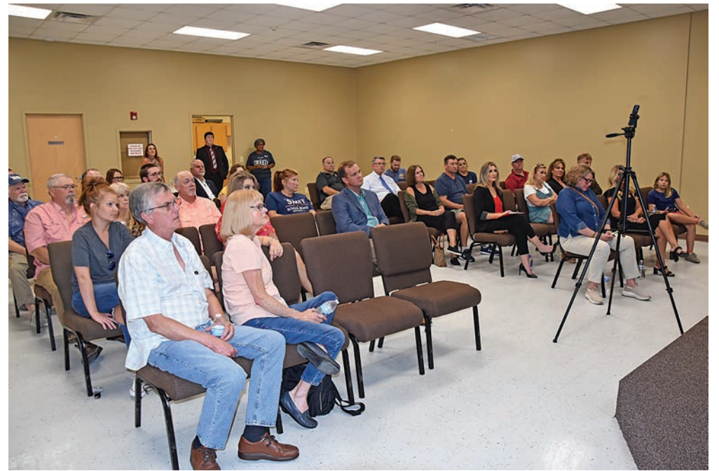
The crowd at the forum.